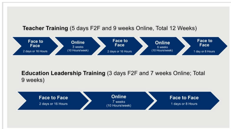
Exhibit 2: HSEA Blended Learning

In Quarter 4 of Year 1 (by the end of September 2024), HSEA aims to train 50 core trainers, and 200 master trainers. Subsequently, HSEA aims to train approximately 8,000 teachers from approximately 300 colleges in Quarter 1 of Year 2 (October-December 2024). This training will be considered a pilot and a pause and reflect and review period will follow. Over the life of the project, HSEA will train 76,000 teachers from a total of 3,000 colleges. This, however, may change depending on whether trainings will warrant follow-up training of cohorts. To incentivize participation and increase the prestige of this training program, core trainers, master trainers, and participating teachers and leaders who complete the training meeting predefined criteria will receive a certificate from the partner university. This criteria will be established in consultations between HSEA and the partner university to ensure it meets the needs/requirements of both parties; it is not envisioned that this certificate or training program would earn university credit.