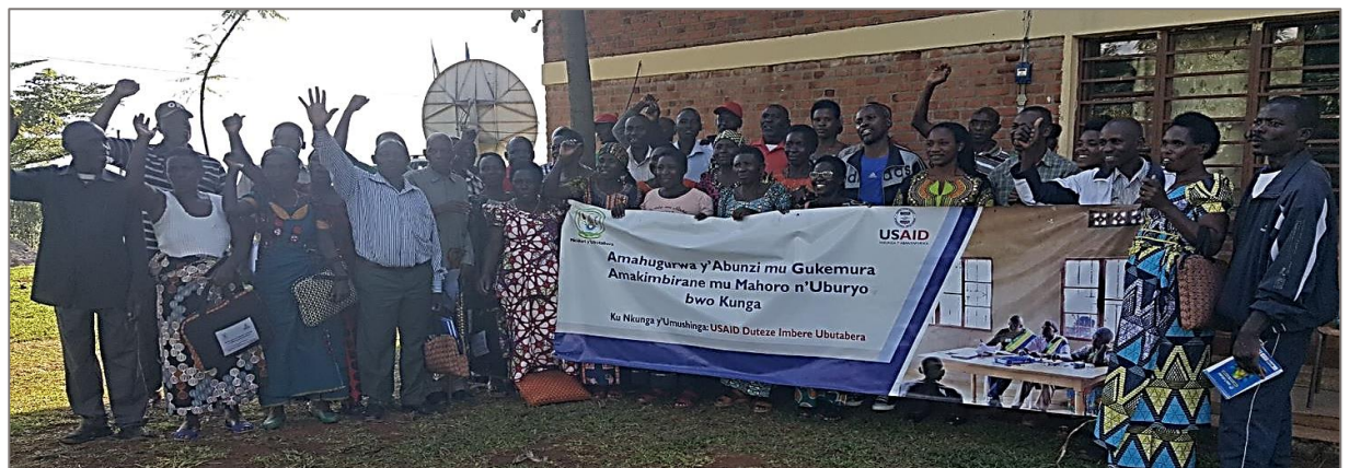
Abunzi mediators completing their training

Mediation. Mediation services seek to prevent disputes from going to court by reconciling the conflicting parties using an external, third party advisor. Mediation is characterized by a flexible and dynamic strategy, seeking to promote understanding and dialogue to prevent escalation to violence. It is praised as an equitable solution – requiring little from the disputing parties in the way of legal knowledge, resources for legal advice, or time for an extended court session. A highly successful example of mediation can be seen in Rwanda, where abunzi 4 mediation committees provide de-escalation services related to civil matters and land ownership. Abunzi mediation has been so successful at resolving issues out of court that it has been made mandatory in many cases—such as nonsexual civil matters